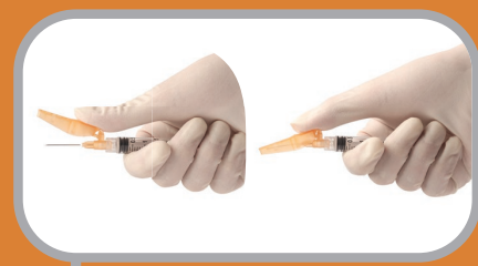
activation with thumb