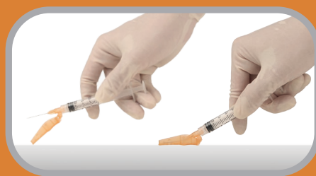
activation against hard surface

Two options for activation of the protective arm: